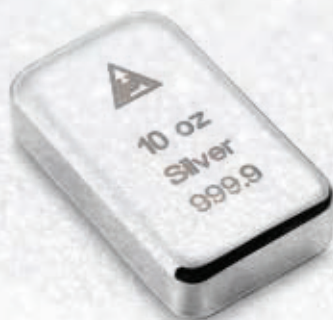
10 oz | Fine Silver | 999.9