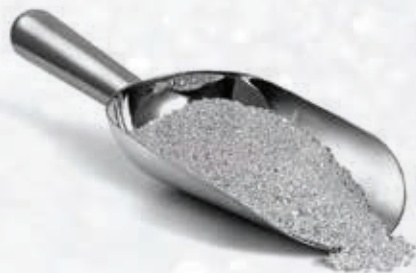
Grains | Fine Silver | 999.9