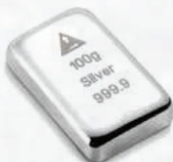
100g | Fine Silver | 999.9