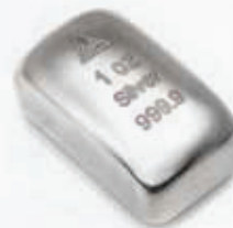
1 oz | Fine Silver | 999.9