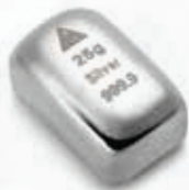
25g | Fine Silver | 999.9