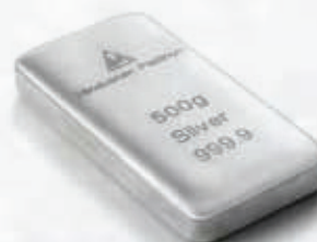
500 gm | Fine Silver | 999.9