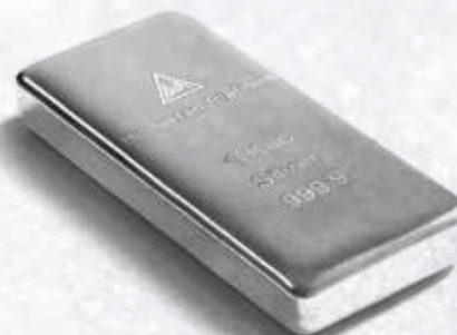
1 kg | Fine Silver | 999.9