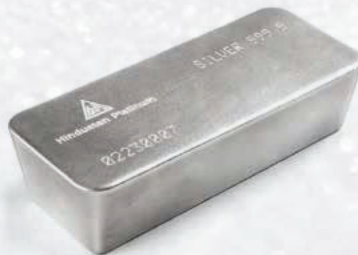
30 kg | Fine Silver | 999.9

Silver bars and grains are available with 999.0 and 999.9 purity.